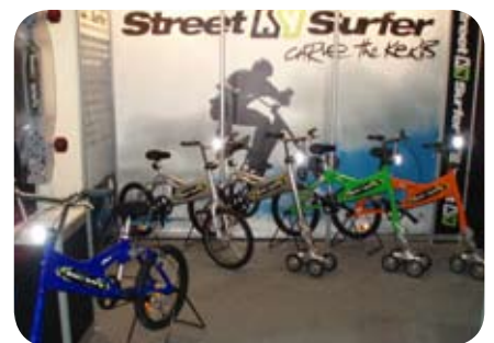
StreetSurfer's booth at Taipei Cycle