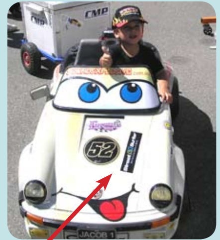
Our first sponsored driver?

This little tyke was one of many motoring enthusiasts who came along to Perth's greatest street machine, hot rod and custom car show, Motorvation. Held in January, the two day event attracted more than 20,000 visitors and we were there to showcase the StreetSurfer and its amazing suspension technology to the enthusiastic crowd.