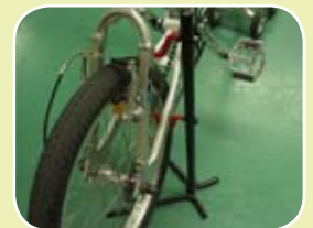
Freestanding bike stand