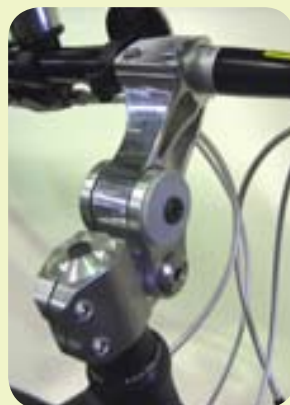
The new handlebar suspension

In addition to our existing front and rear suspension units, StreetSurfer's own mad scientist, Aldo Contarino, has been busily developing our amazing suspension technology for handlebars and seat posts. These new suspension systems are suited to all bicycle types and judging by the response they received at Taipei, looks like they may prove to be an important part of our product range.