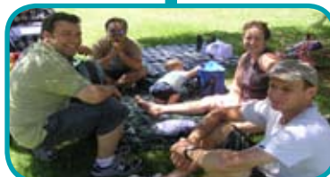
Some of the shareholders enjoying their Surfers and the company.